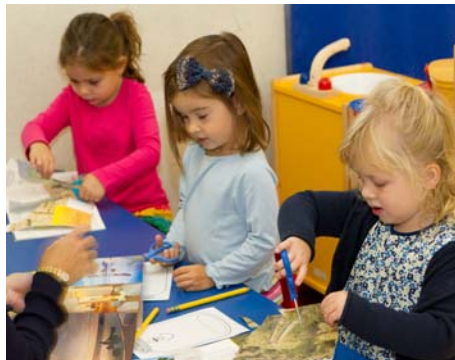
Fine motor skills are being honed while using scissors to cut out pictures for the jumble jars.