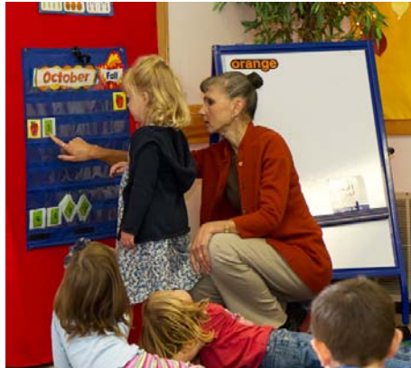
Working hard to learn the season, month and days during circle time.

Both classes continue to work on fine motor skills and use of school tools. Baseline assessments continue in all areas of development.