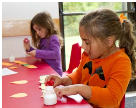
Learning about patterns is made fun with these jack-o-lantern hats.